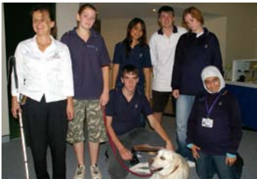
Members of the Student Guild at the Association for the Blind & Guide Dogs WA

Students can complete the 20 hours in a number of ways, either participating in school-organised activities (e.g. Harmony Day) or parent-organised activities (e.g. volunteer at animal refuge).