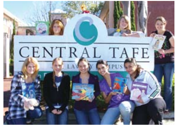
Students studying the Cert. III Teacher's Assistant Course

As well as the above, the College works closely with TAFEWA and private training organisations to offer students the opportunity to complete partial/full certificates in highly sought after areas such as Applied Fashion Design and Technology and Teacher's Assistant.